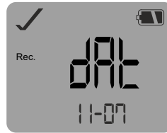
5. System Date: Month-Day