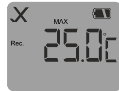
3. Maximum Temperature