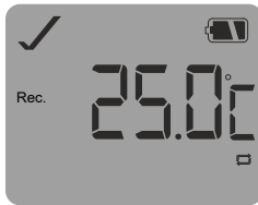
1. Current Temperature

A single click on the button allows you to browse all LCD Pages