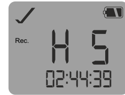
6. System Time: Hour:Minute

Vac-TL-01 single use PDF temperature data logger is low-power LCD data logger with a USB connector that allows quick access to pdf data report without use of any software or cable. It is ideal to monitor temperature sensitive products through all stages of storage and transport in cold chain, pharmaceuticals, food Industries.