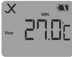
4. Minimum Temperature